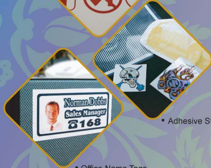
• Adhesive Stickers