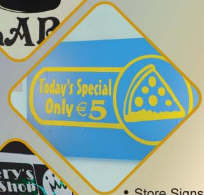
• Store Signs