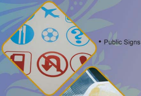
• Public Signs